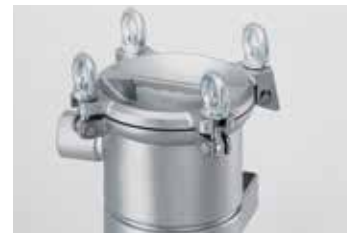
Ergonomic, integral cover handle is easy to open and close