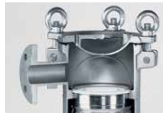
Compression bag hold down creates 360 degree sealing between filter bag and bag filter housing